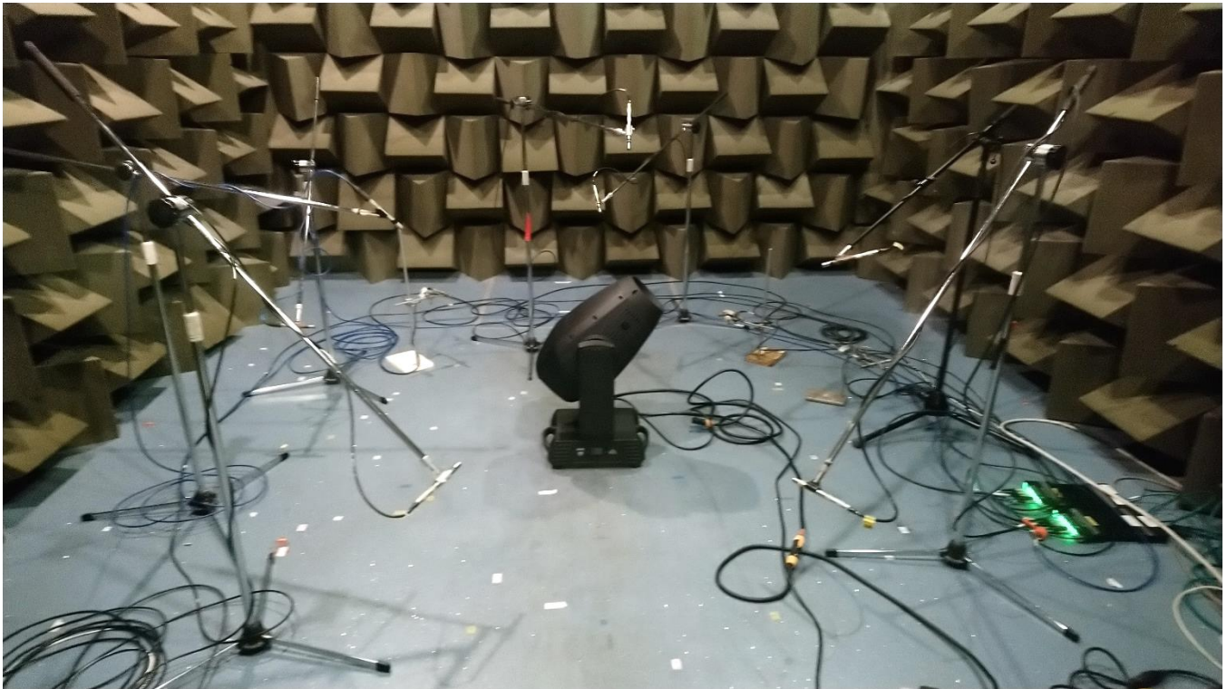
Figure 1 – unit under test mounted in the hemi-anechoic chamber at the University of Salford.