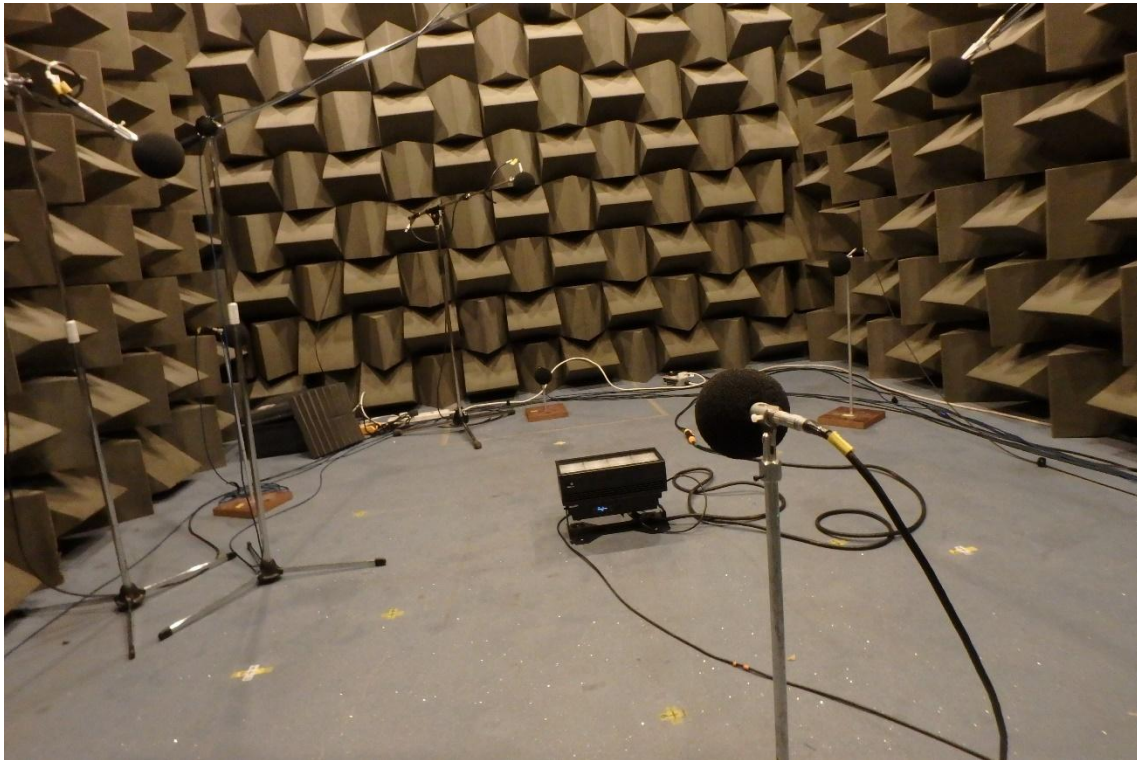
Figure 1 – unit under test mounted in the hemi-anechoic chamber at the University of Salford.