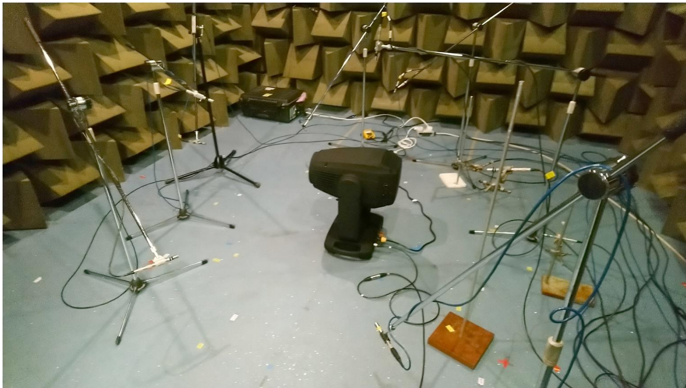
Figure 1 – unit under test mounted in the hemi-anechoic chamber at the University of Salford.