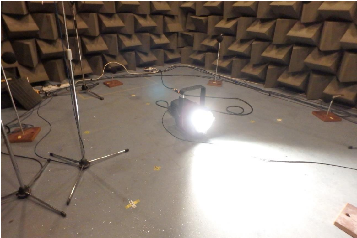
Figure 1 – unit under test mounted in the hemi-anechoic chamber at the University of Salford.