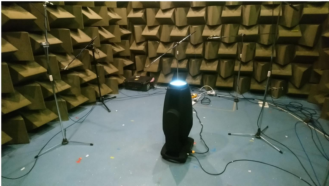
Figure 1 – unit under test mounted in the hemi-anechoic chamber at the University of Salford.