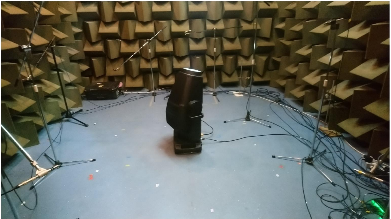
Figure 1 - unit under test mounted in the hemi-anechoic chamber at the University of Salford.