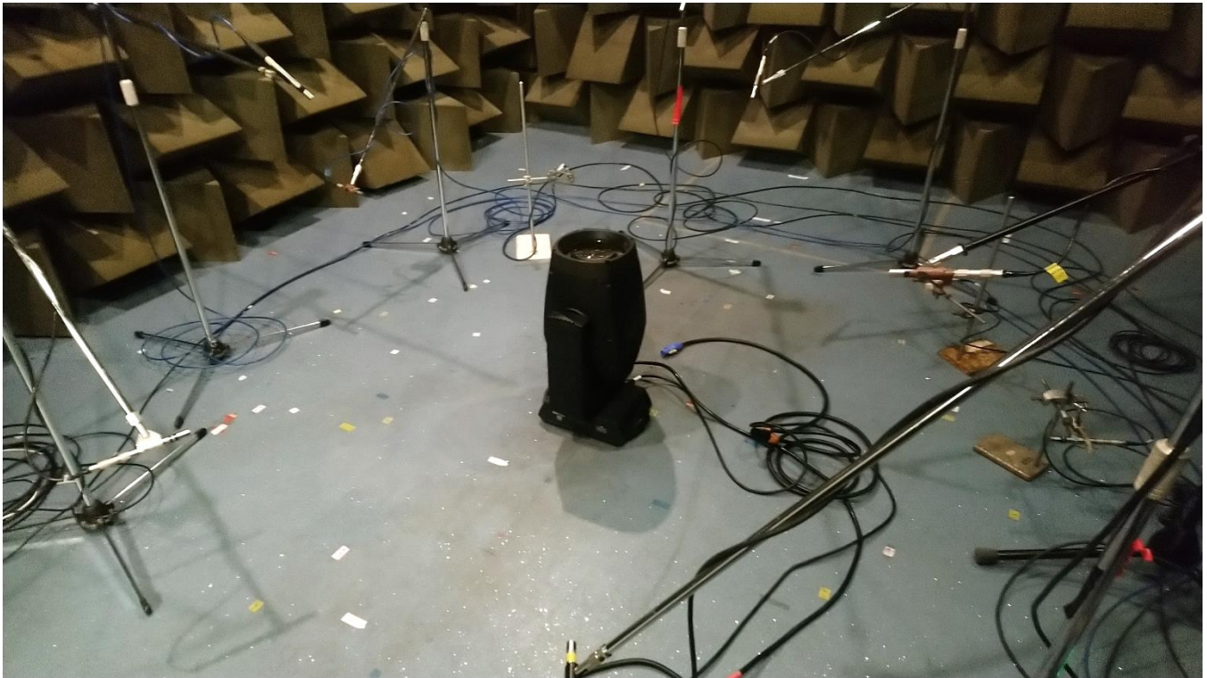
Figure 1 – unit under test mounted in the hemi-anechoic chamber at the University of Salford.