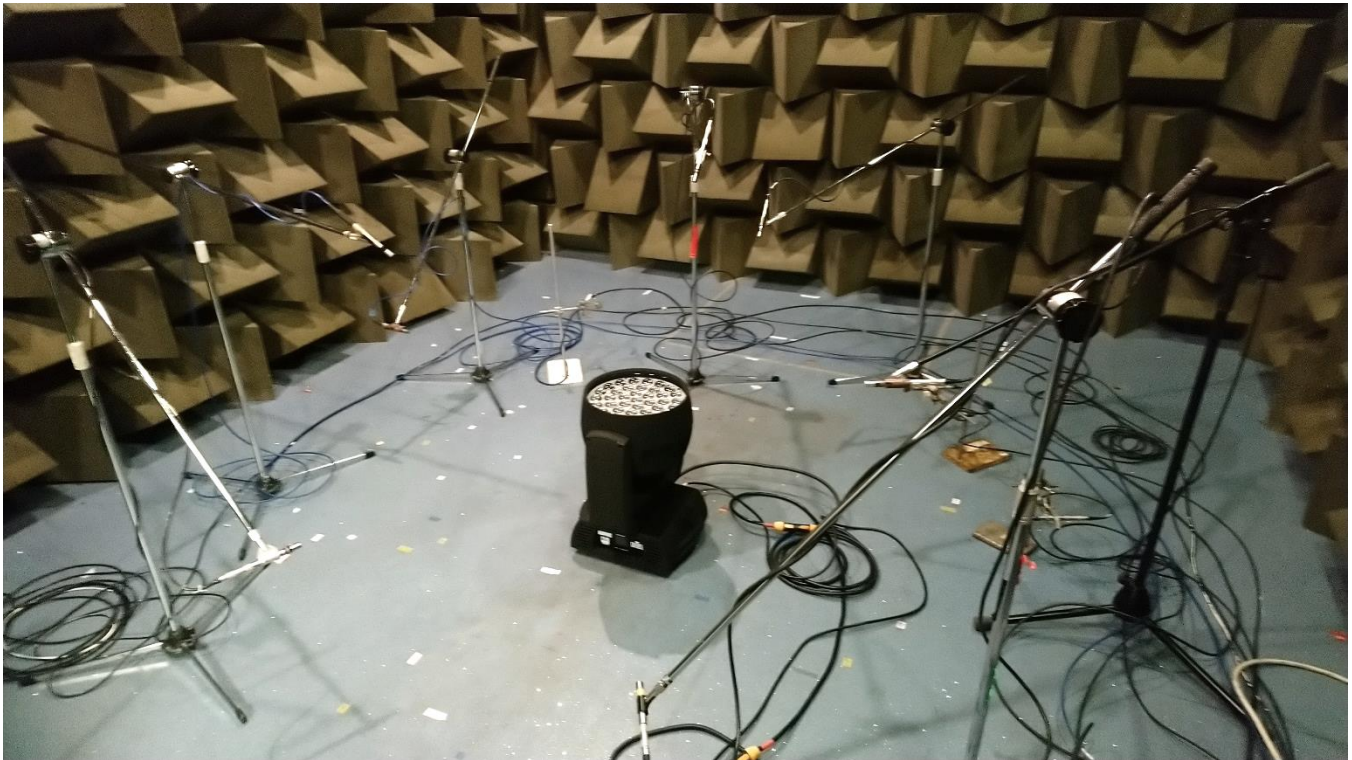
Figure 1 – unit under test mounted in the hemi-anechoic chamber at the University of Salford.