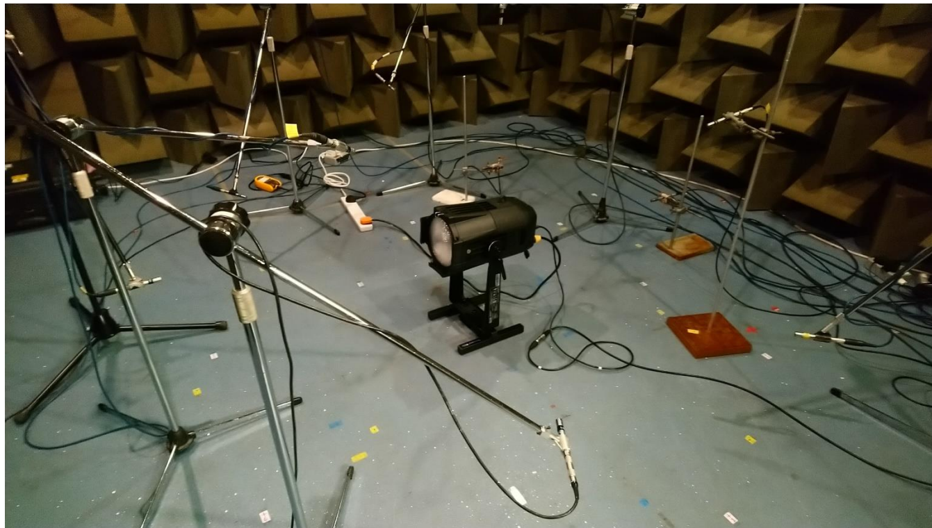
Figure 2.1 – Example of the typical arrangement of a unit under test, as mounted in the hemi-anechoic chamber at the University of Salford. (N.B. this image does not represent the specific unit covered by this Test Report.)