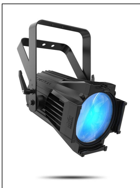
Figure 1.0 – Client image of unit type under test, “OVATION P56 FC”.

2.5 For measurement of the sound pressure level of the Reference Sound Source (RSS), the RSS was placed directly on the floor of the hemi-anechoic chamber at the same location as the unit under test as defined in BS EN ISO 3744: 2010.